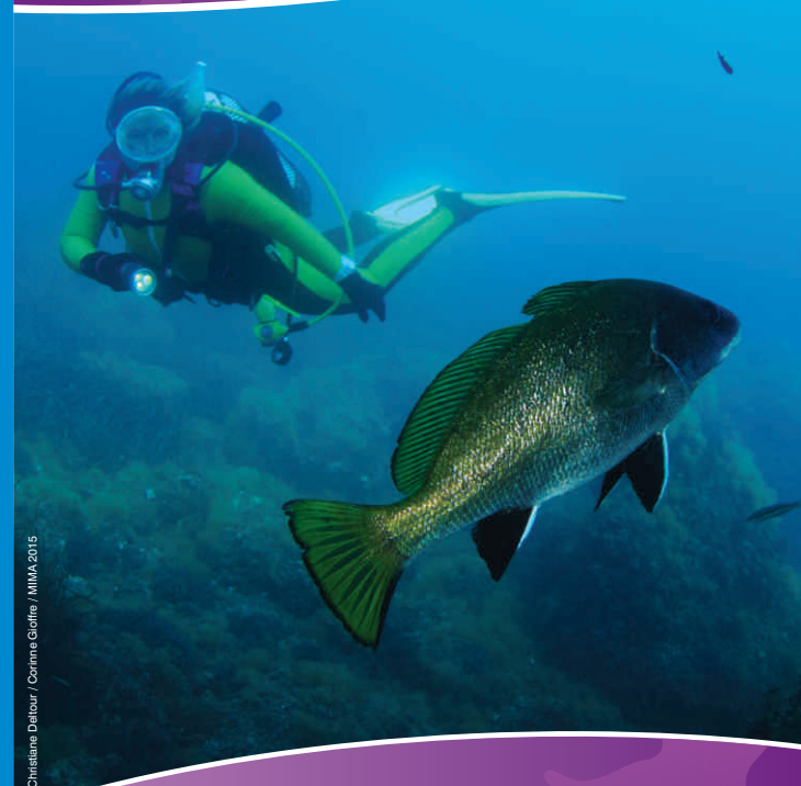
Christiane Delbour / Corinne Goffre / MMA 2015