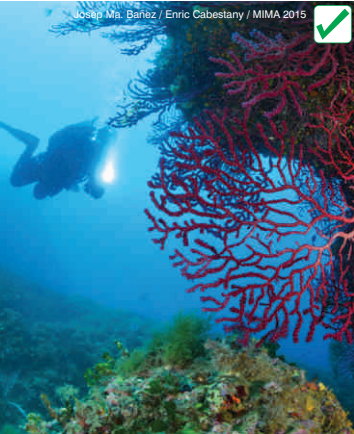
José Ma. Baré / Enric Cabestany / MIMA 2015

The coralline is formed by very fragile, slow-growing species. Contact tends to damage them. Avoid handling them or touching them involuntarily.