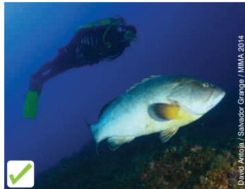
David Antoja / Salvador Grange / MIMA 2014

The diversity of fish populations is one of the main assets of its waters. You can observe them without offering them food.